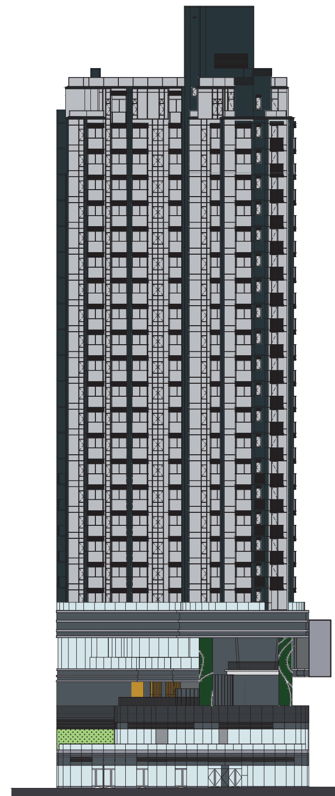
北面立面圖 North Elevation Plan

Authorized person for the development certified that the elevations shown on these elevation plans: