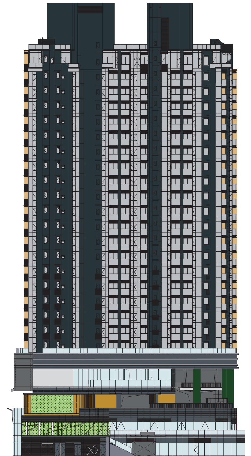
東面立面圖 East Elevation Plan