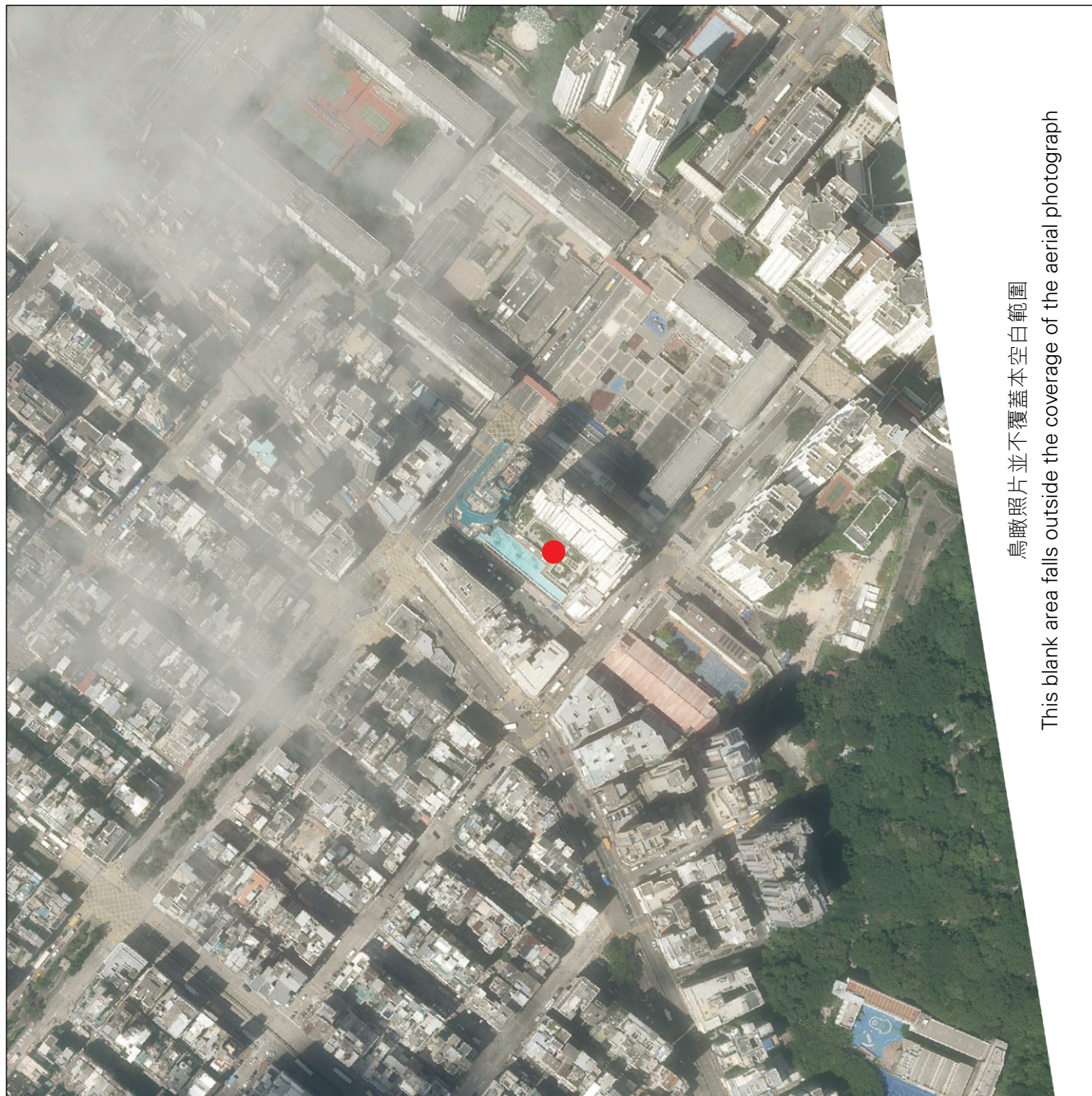
鳥瞰照片並不覆蓋本空白範圍 This blank area falls outside the coverage of the aerial photograph