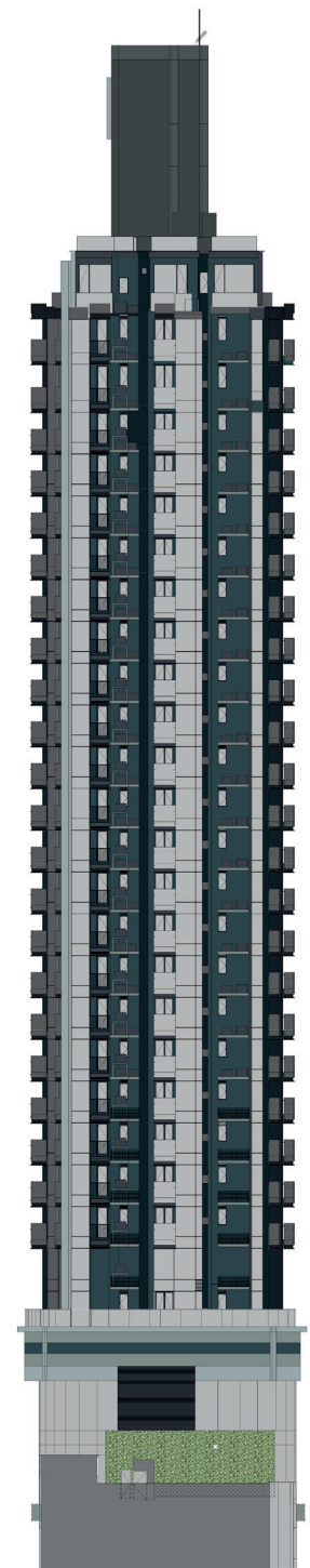
東面立面圖 East Elevation