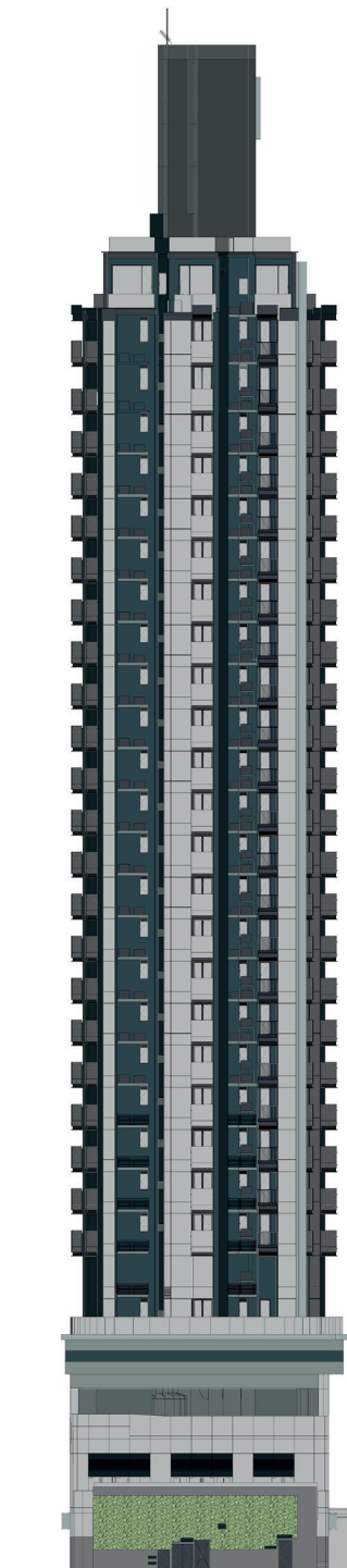
西面立面圖 West Elevation