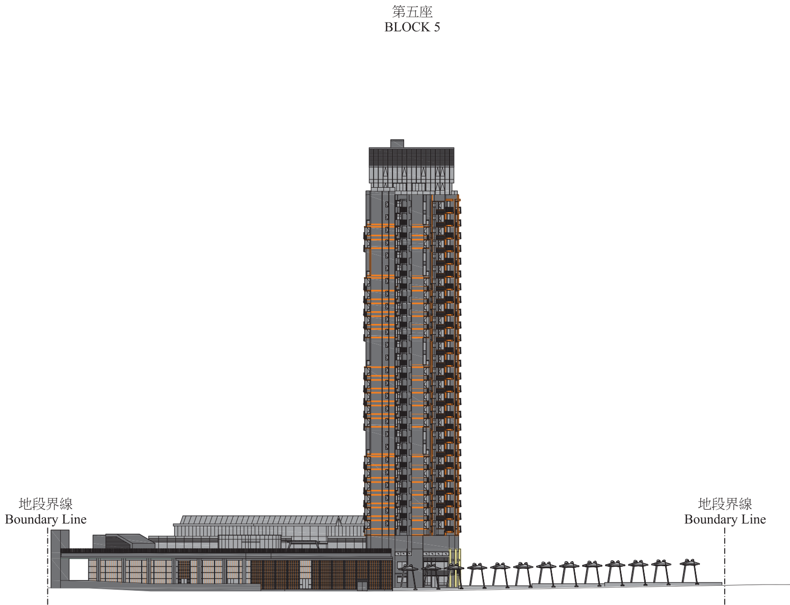
西北面立面圖 NORTH-WEST ELEVATION