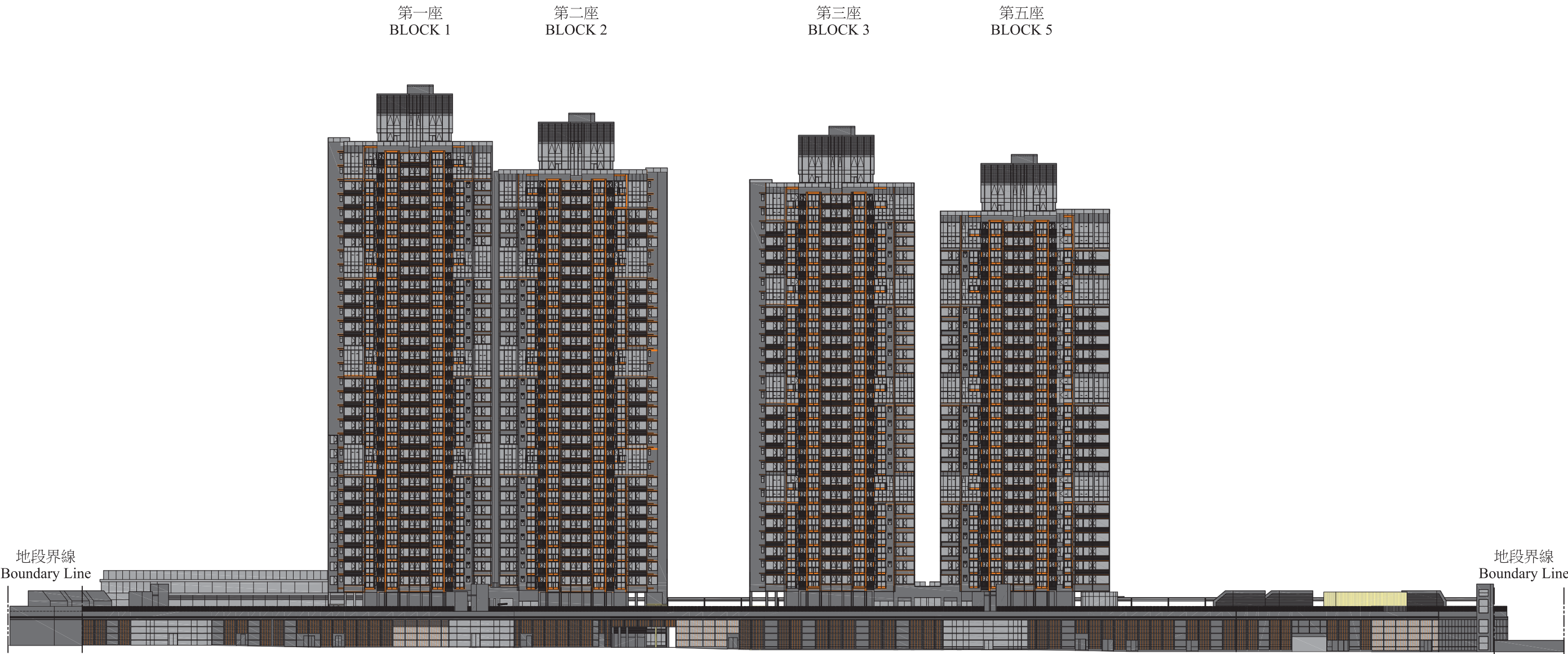
東北面立面圖 NORTH-EAST ELEVATION

期數的認可人士已證明本圖所顯示的立面： 1. 以2013年3月28日的情況為準的期數的經批准的建築圖則為基礎擬備；及 2. 大致上與本發展項目的外觀一致。 Authorized person for the Phase certified that the elevations shown on this plan: 1. are prepared on the basis of the approved building plans for the Phase as of 28th March 2013; and 2. are in general accordance with the outward appearance of the development.