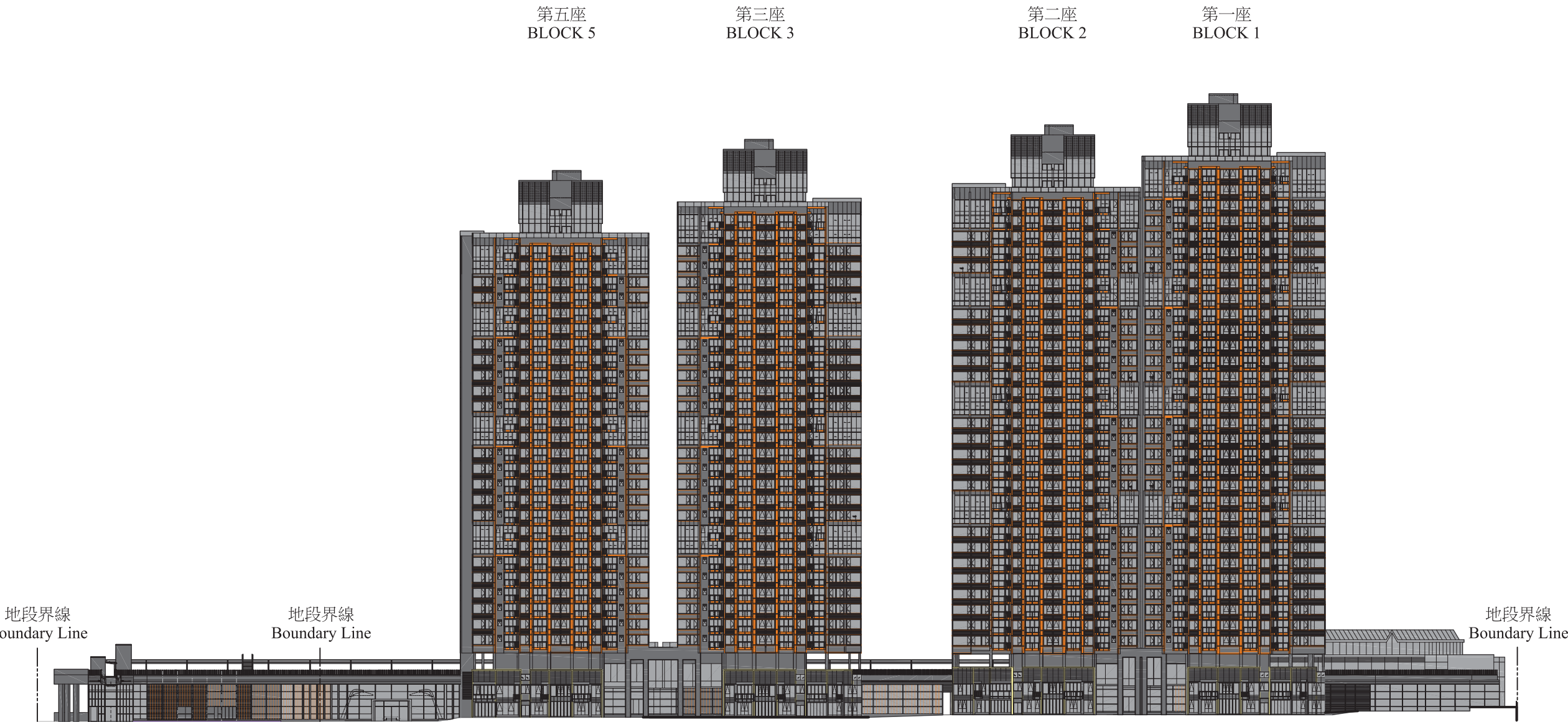
西南面立面圖 SOUTH-WEST ELEVATION

期數的認可人士已證明本圖所顯示的立面： 1. 以2013年3月28日的情況為準的期數的經批准的建築圖則為基礎擬備；及 2. 大致上與本發展項目的外觀一致。 Authorized person for the Phase certified that the elevations shown on this plan: 1. are prepared on the basis of the approved building plans for the Phase as of 28th March 2013; and 2. are in general accordance with the outward appearance of the development.