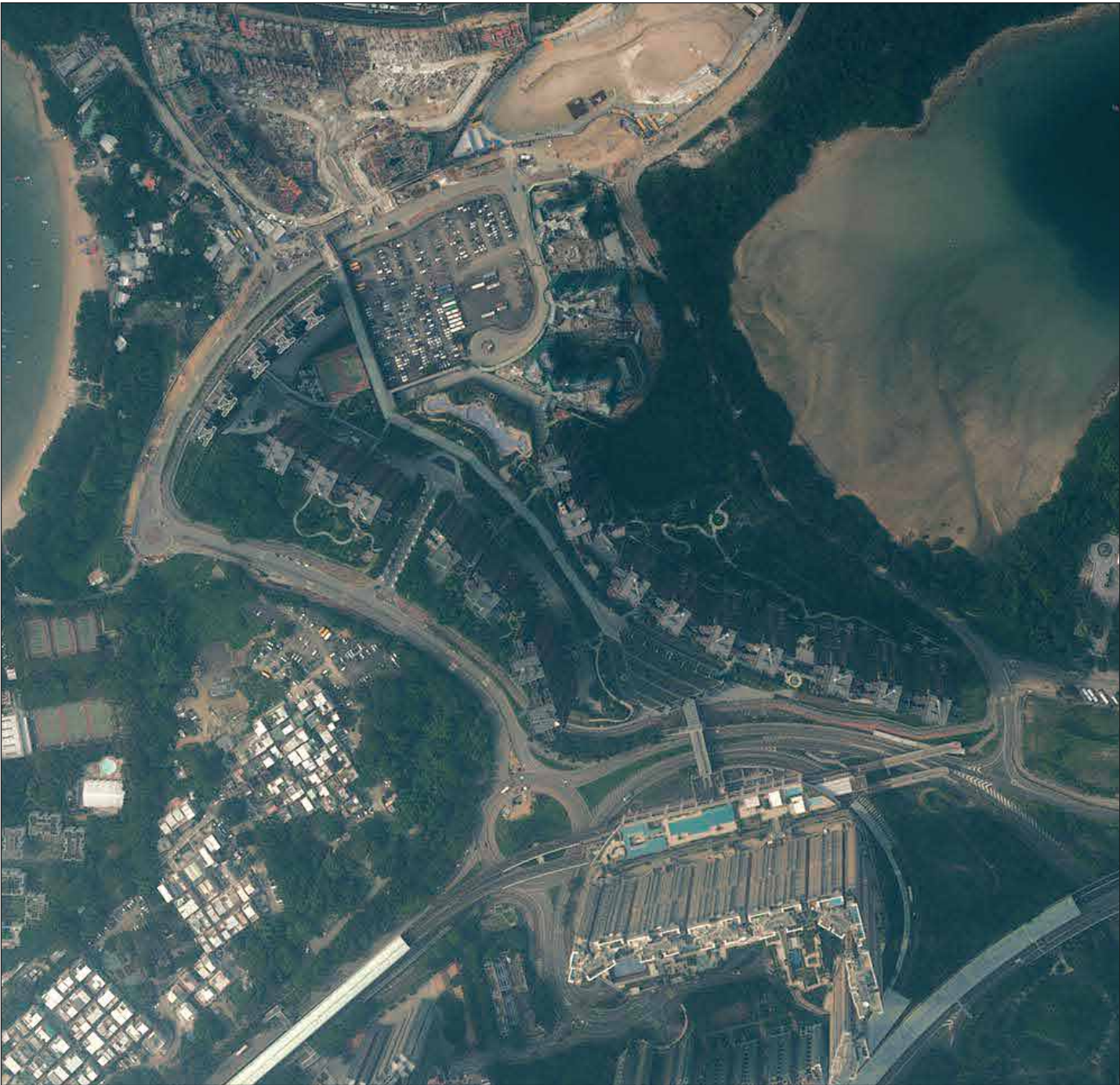
航空照片由香港地理數據站提供，香港特別行政區政府為知識產權擁有人。 The Aerial Photo is provided by the Hong Kong GeoData Store and intellectual property rights are owned by the Government of the HKSAR.

摘錄自地政總署測繪處於2017年4月29日在烏溪沙6,900呎飛行高度拍攝之鳥瞰照片，編號為E023497C。 Adopted from part of the aerial photograph taken by the Survey and Mapping Office of Lands Department at a flying height 6,900 feet in Wu Kai Sha. Photo No. E023497C, dated 29th April 2017.