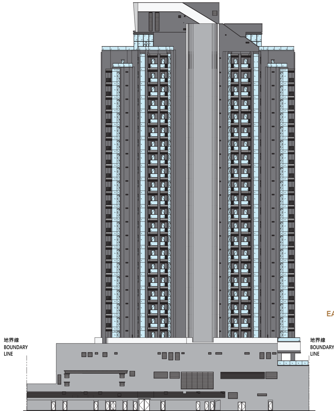
東立面圖 EAST ELEVATION