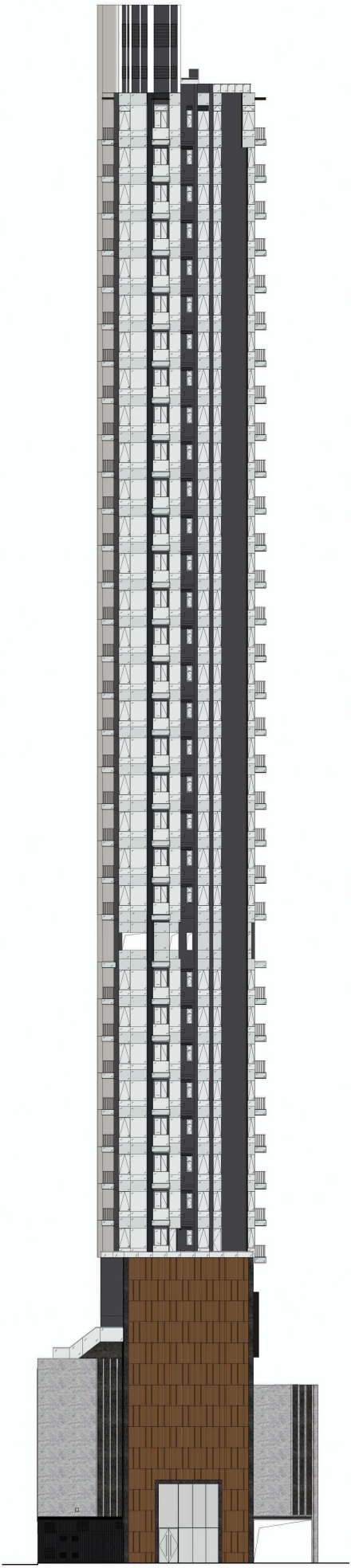
North-East Elevation 東北立面圖

Authorized Person for the development certified that the elevations shown on these elevation plans: 1. are prepared on the basis of the approved building plans for the development as of 4 July 2016; and 2. are in general accordance with the outward appearance of the development.