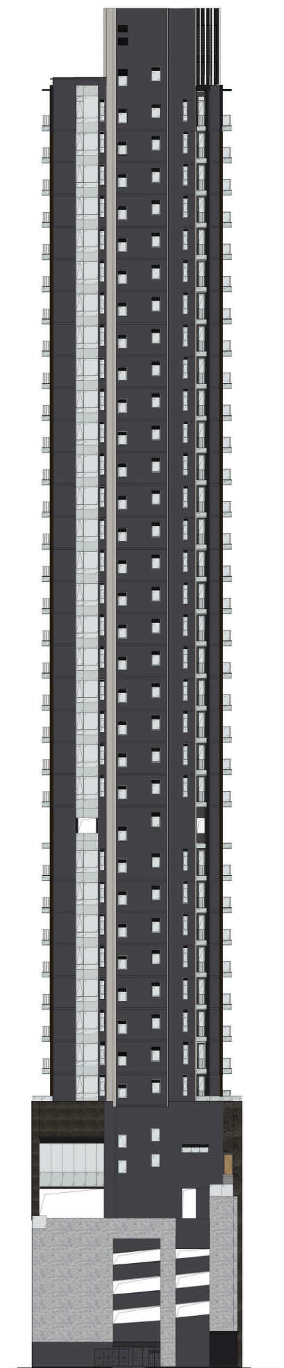
South-East Elevation 東南立面圖