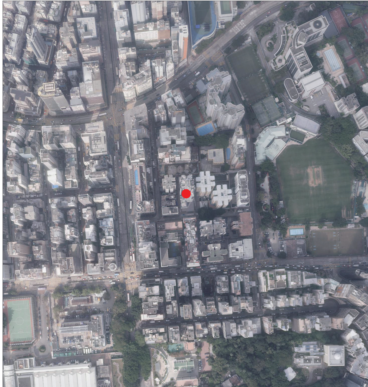
● 發展項目的位置 Location of the Development

備註：因技術性問題，此鳥瞰照片所顯示的範圍超過《一手住宅物業銷售條例》的規定。 Note : Due to technical reasons, this aerial photograph has shown more than the area required under the Residential Properties (First-hand Sales) Ordinance.