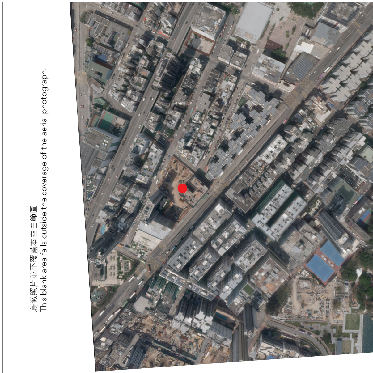
鳥瞰照片並不覆蓋本空白範圍。 This blank area falls outside the coverage of the aerial photograph.

摘錄自地政總署測繪處於2024年3月20日在土瓜灣2,000呎飛行高度拍攝之鳥瞰照片，編號為E221096C。