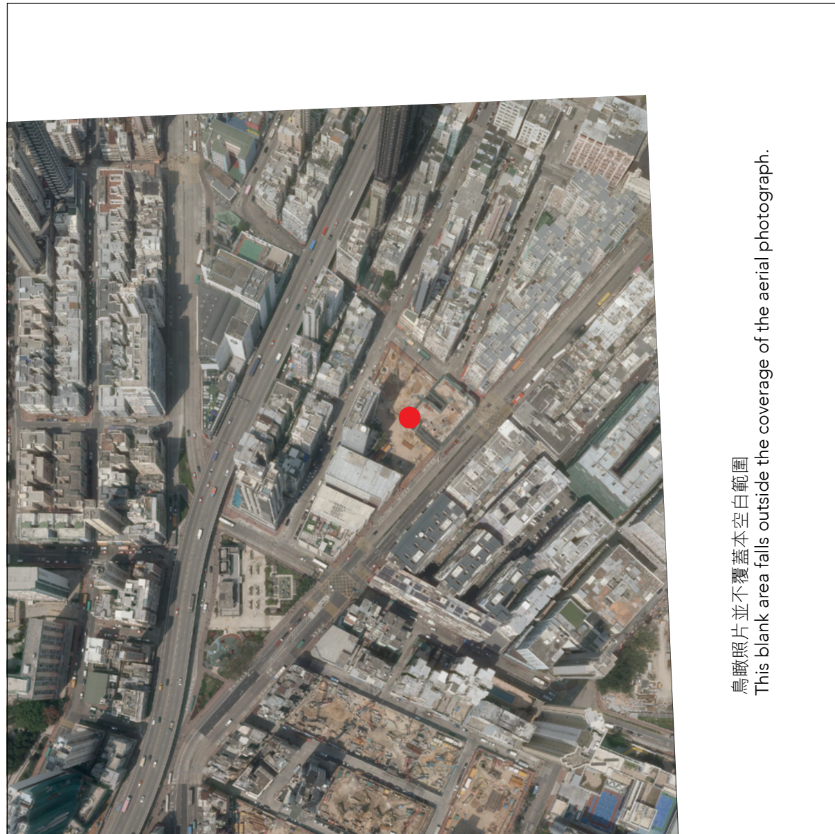
鳥瞰照片並不覆蓋本空白範圍 This blank area falls outside the coverage of the aerial photograph.

摘錄自地政總署測繪處於2024年3月20日在土瓜灣2,000呎飛行高度拍攝之鳥瞰照片，編號為E221340C。