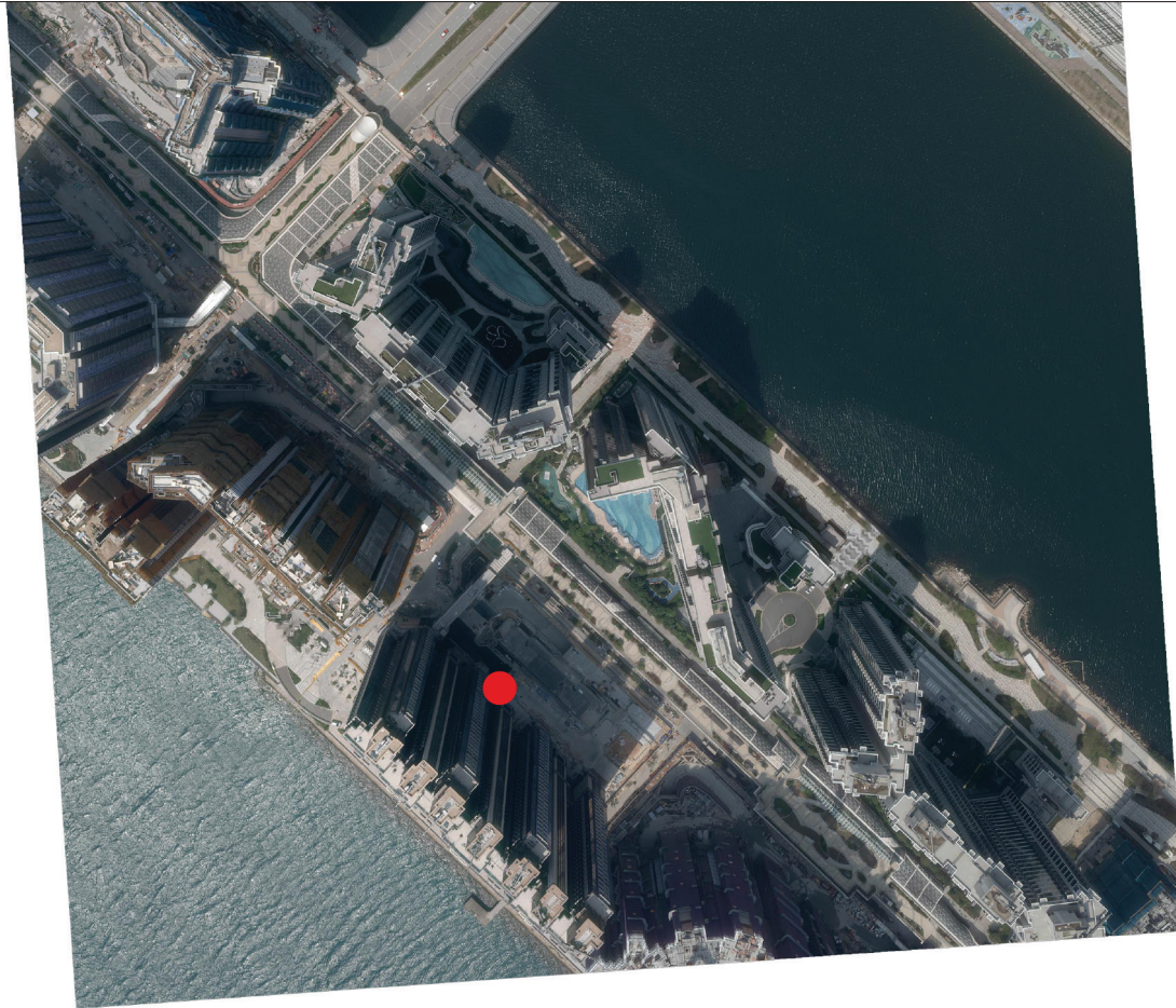
鳥瞰照片並不覆蓋本空白範圍 This blank area falls outside the coverage of the relevant aerial photograph